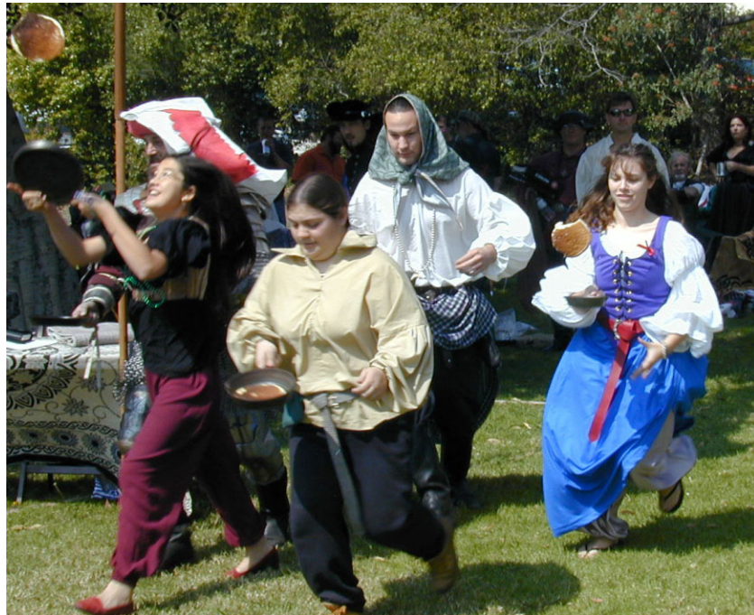
FROM THE MARCH 2003 EVENT -START OF THE PANCAKE RACE

All Members are reminded that the annual renewal is coming up July 1st! Please get your dues in ASAP to keep from getting caught in the Empire wide crush.